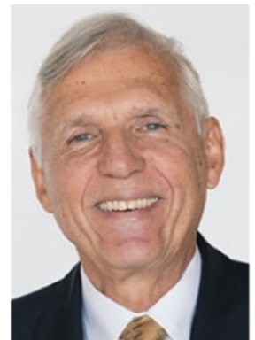
Jordá // File Photo: Citgo.